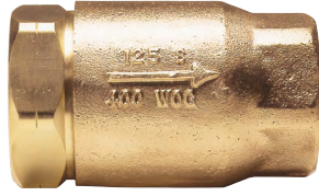
61-100 FEMALE x FEMALE THREADED 1/4" THROUGH 3"