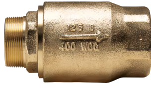
61-200 MALE x FEMALE THREADED 1/4" THROUGH 2"