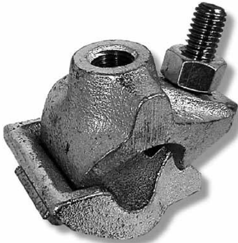
Model "ST" (With iron pipe thread)

The Skinner-Seal Saddle Tee is particularly recommended for installing garden gas lights, gas grills, automatic home laundries and other appliances. It takes the place of a tee, union and nipple in one fixture. No pipe cutting or threading is necessary. The cutting in